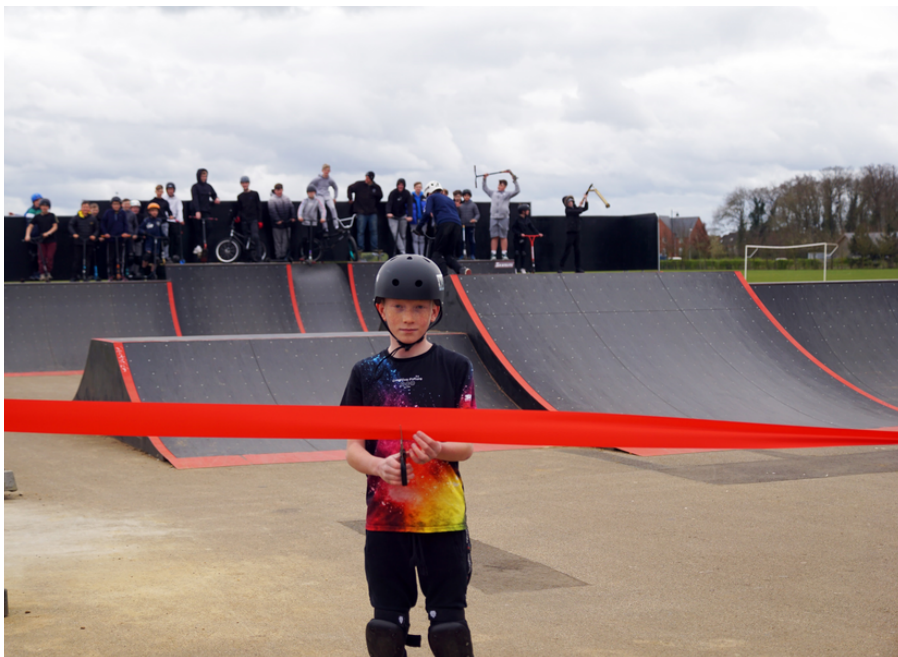
Official opening of the refurbished Skatepark

A partially sheltered seating area was also installed for socialising.