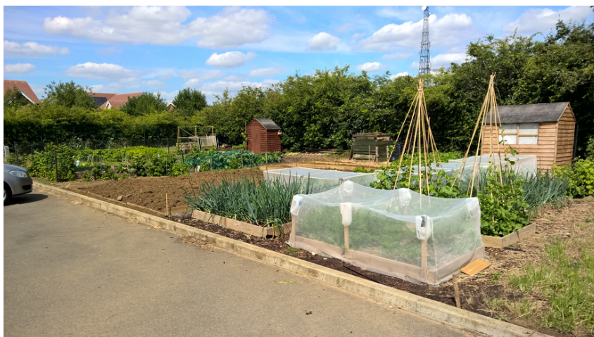
Brace Dein Allotments

Cambourne residents can be added to the waiting list by contacting the Town Office. A third allotment site is planned for West Cambourne.