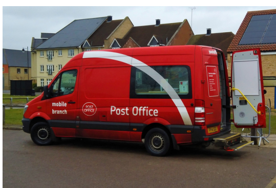
Mobile Post Office

The van closes its doors promptly at 4pm to ensure post arrives back in time to be sorted and collected.