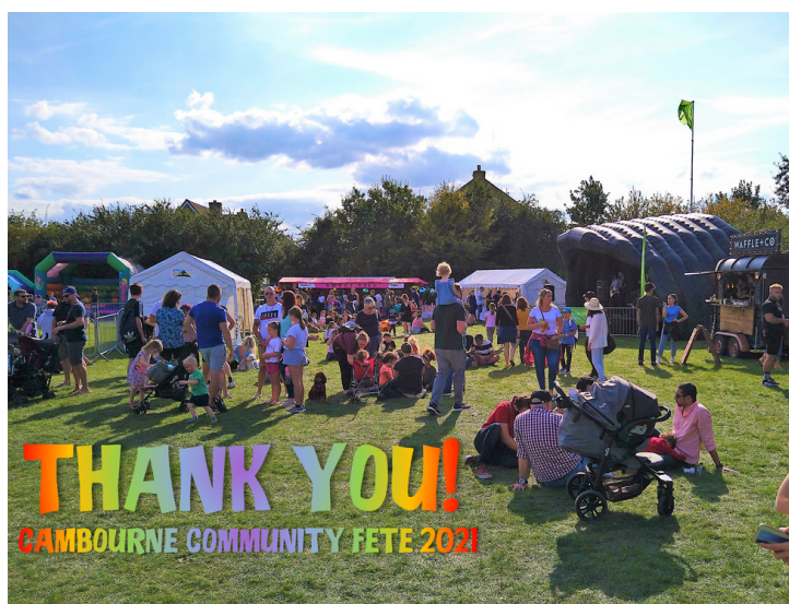
Cambourne Community Fete 2021

Cambourne Community Fete is one of the big events that the Town Council organises annually in September. The first event was organised in 2015 and it has grown each year. The day consists of fun amusements, music, community stalls, local businesses and charities. It is always well attended and supported by the community whether it be rain or sunshine.