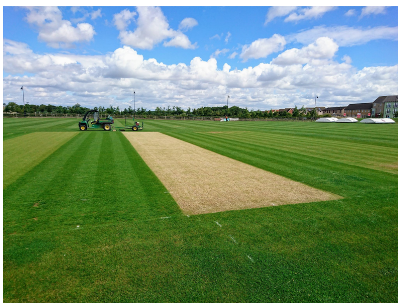
Great Cambourne Cricket Pitch

For more information on Cambourne Cricket Club visit www.cambournecc.com