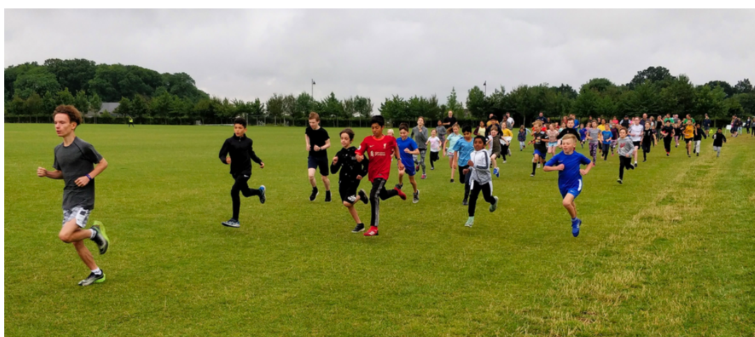
Junior Park Run