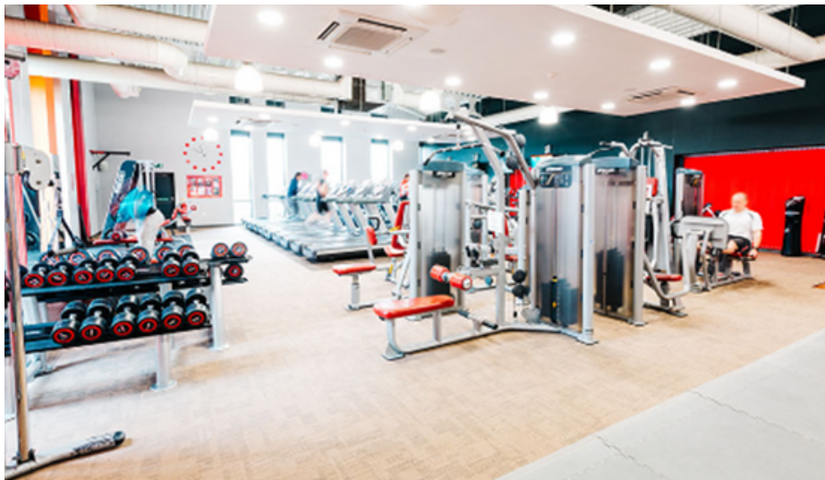
Gym at Cambourne Fitness & Sports Centre

www.everyoneactive.com/centre/cambourne-fitness-and-sports-centre