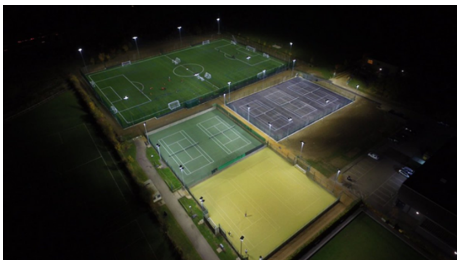
3G, MUGA and Tennis Courts

For enquiries on booking the 3G or MUGA, please contact the Town Office.