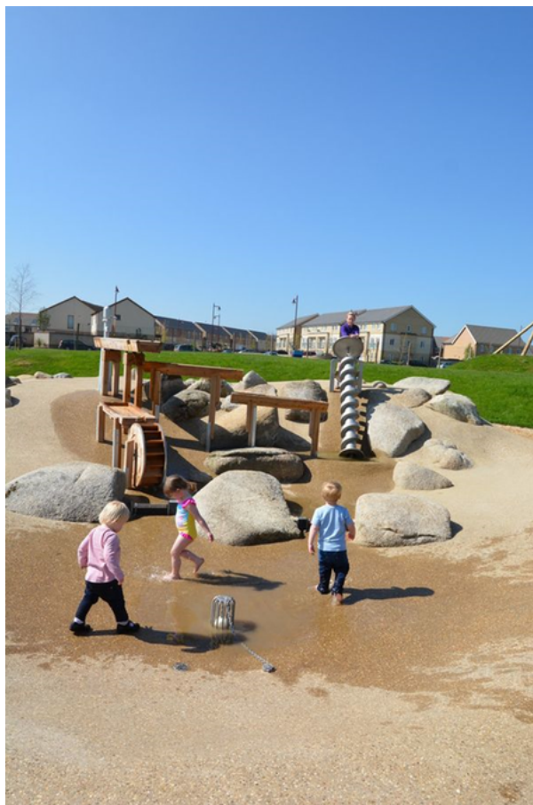
Sand & Water play area

The Town Council also maintains SIPs (Site of Imaginative Play) such as the wooden boat on New Hall Lane.