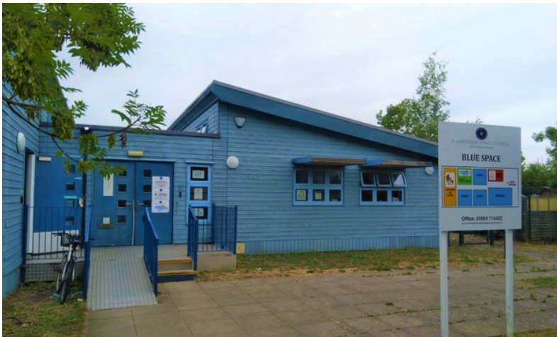
The Blue Space