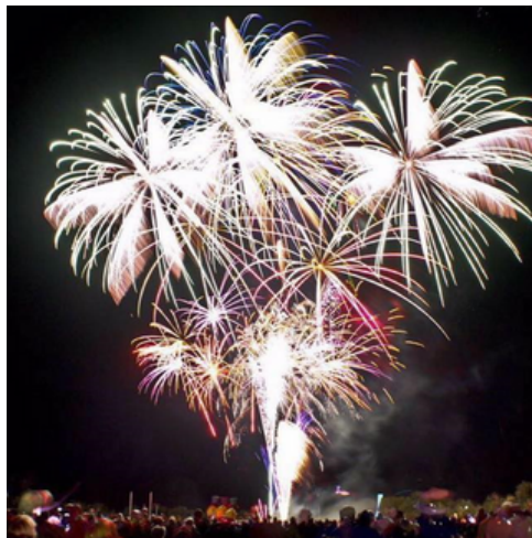
Cambourne Fireworks Display

The Town Council has also supported other community events such as: