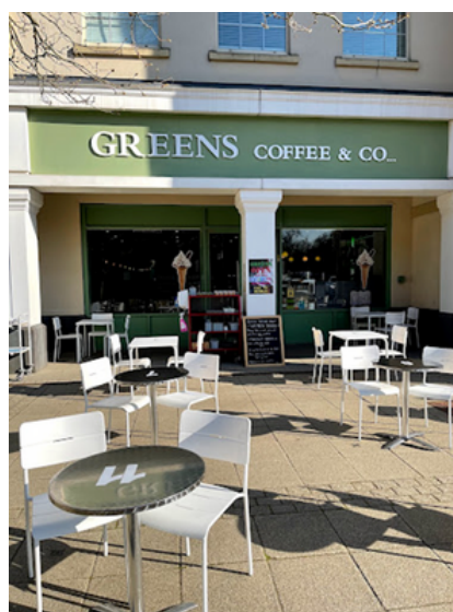
Greens Coffee Shop