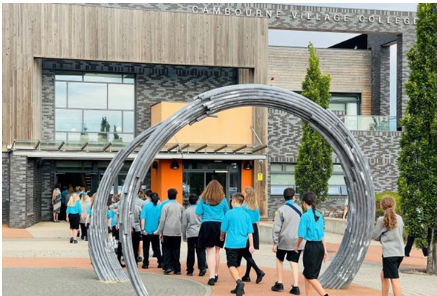
Cambourne Village College

Cambourne Village College is the secondary school and will also introduce a sixth form in 2024.