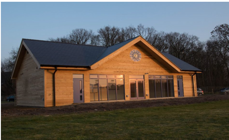
Great Cambourne Cricket Pavilion