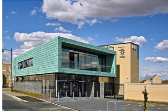
Cambourne Police Station

The station is situated on Sackville Way and acts as a base for South Cambridgeshire Police. The front desk is open on particular days and times, but preferred method of contact is via the website online forms or email.