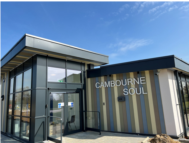
Cambourne Soul youth building