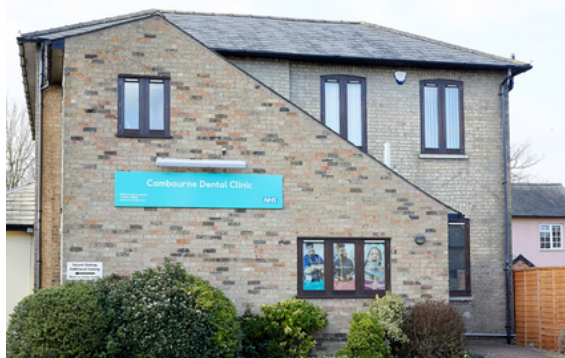
Cambourne Dental Clinic

The dental clinic is situated on Monkfield Lane in Great Cambourne. The clinic is part of Colosseum Dental and takes private and NHS patients.