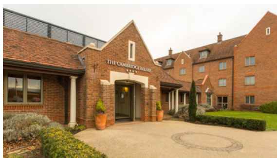
Cambridge Belfry Hotel