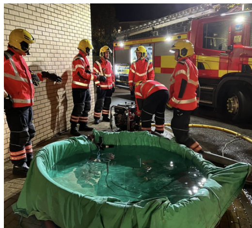
Cambourne Fire Fighters