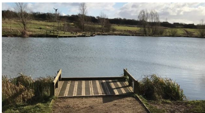
Lake Ewart fishing lake